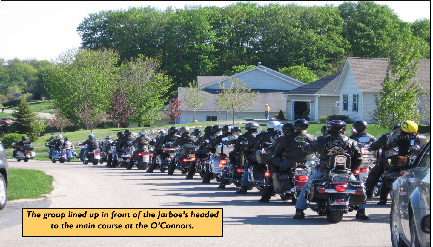
The group lined up in front of the Jarboe's headed to the main course at the O'Connors.