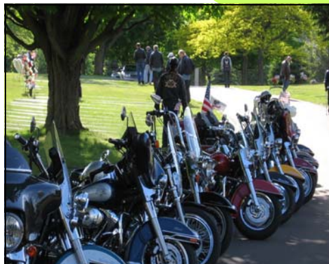
30+ bikes attend the Memorial Day ceremonies