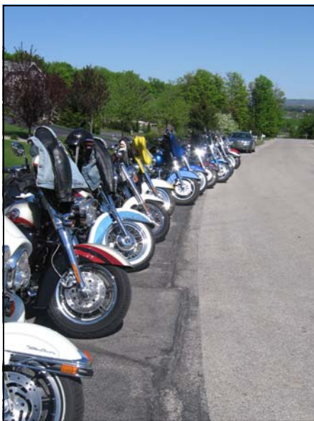
The street becomes the parking lot!