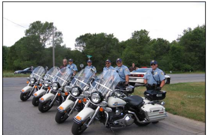
Law Enforcement officials hard at work!