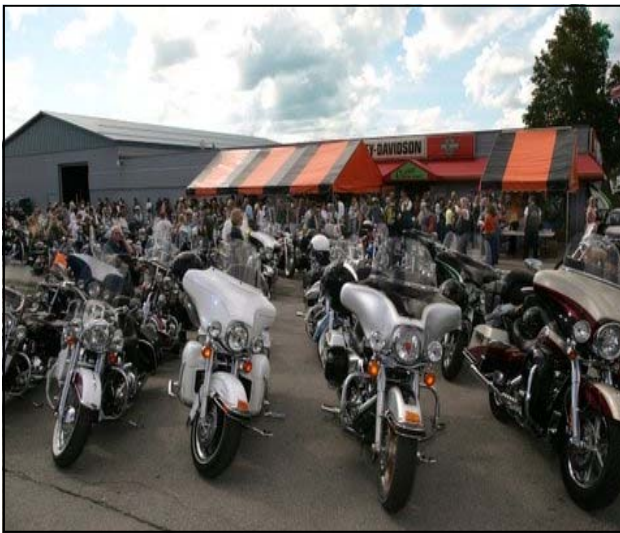
The line-up of bikes before the ride