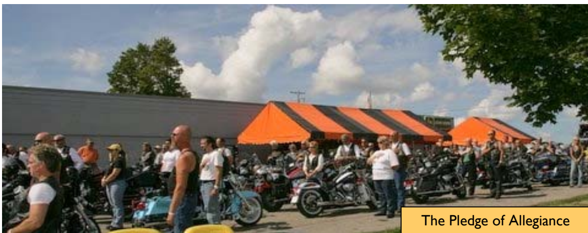
The Pledge of Allegiance

WEDNESDAY, AUGUST 2nd—MEET AT CLASSIC MOTOR SPORTS @ 6:15PM