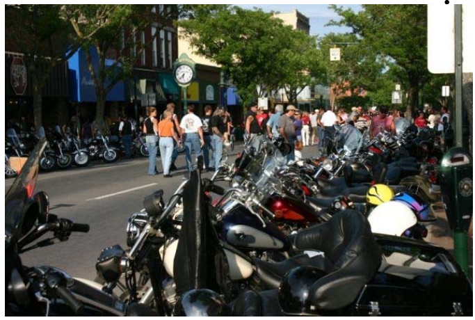
The view downtown Saturday night